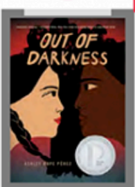
OUT OF DARKNESS by Ashley Hope Perez REASON: claimed to be sexually explicit