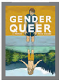
GENDER QUEER by Maia Kobabe REASONS: LGBTQIA+ content, claimed to be sexually explicit