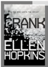
CRANK by Ellen Hopkins REASONS: claimed to be sexually explicit, drugs