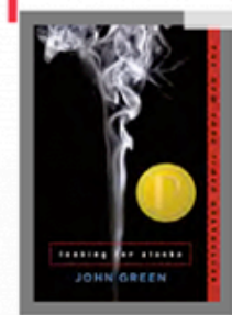
LOOKING FOR ALASKA by John Green REASONS: claimed to be sexually explicit, LGBTQIA+ content