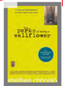
THE PERKS OF BEING A WALLFLOWER by Stephen Chbosky REASONS: claimed to be sexually explicit, LGBTQIA+ content, rape, drugs, profanity