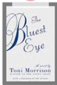
THE BLUEST EYE by Toni Morrison REASONS: rape, incest, claimed to be sexually explicit, EDI content