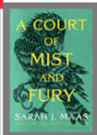
A COURT OF MIST AND FURY by Sarah J. Maas REASON: claimed to be sexually explicit