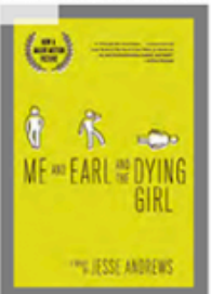
ME AND EARL AND THE DYING GIRL by Jesse Andrews REASONS: claimed to be sexually explicit, profanity